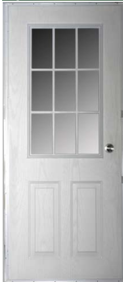
Eliminator Door With Optional 9-lite window

ELIXIR® Eliminator Series Thermal outswing door is constructed from vinyl laminated galvanized steel. Our Eliminator Series is the first door in the industry to truly offer a full thermal break unit. We continue to offer products that are innovative and respond to the needs of our industry, and the Eliminator Series is one of the results of that commitment. Our thermal break eliminates transfer of cold and frost from the exterior to interior while eliminating condensation due to differences between exterior and interior climates. This door comes with weatherstripping on both the jamb and the door to create a double seal that protects against air, light, and water penetration. Other features include a highly energy efficient polyurethane foam insulation, high R-Values, and a vinyl sweep. With a wide range of available sizes and window options, the ELIXIR Eliminator Series door will fit most of your application needs.